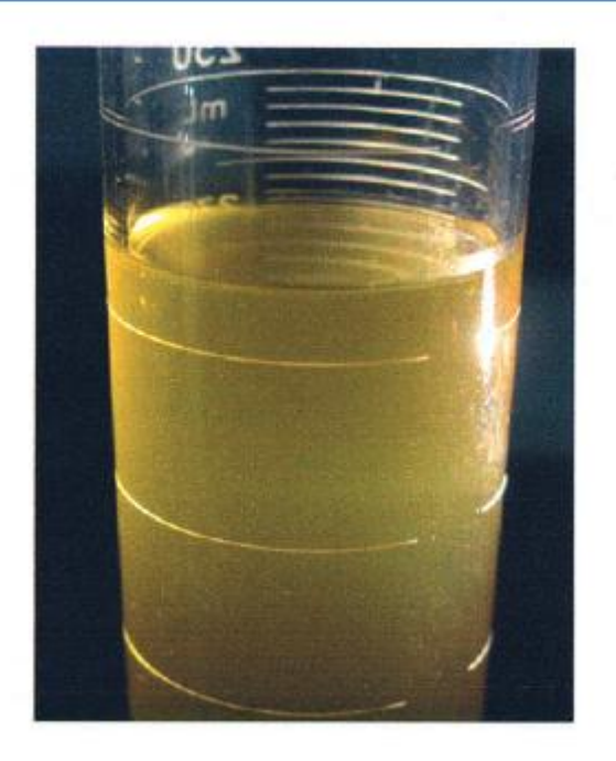
Figure 2: SAG 1572 silicone antifoam emulsion at 0.3% use level in a non-ionic spray adjuvant formulation.