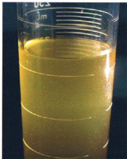
Figure 2: SAG 1572 silicone antifoam emulsion at 0.3% use level in a non-ionic spray adjuvant formulation.