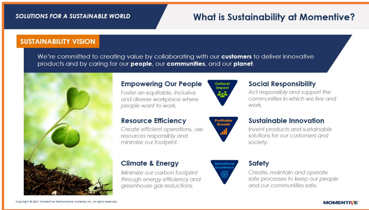
Momentive's Six Most Material Priorities as per the 2020 Materiality Assessment.

The resulting list of material priorities form the foundation of our 2025 Sustainability strategy and are summarized into six categories, shown below. These priorities align with Vision 2025 and are the basis for a broad-based employee awareness campaign that began in late 2020 and is ongoing. They reflect and ensure the highest possible degree of alignment between our sustainability priorities and our public communications of progress.